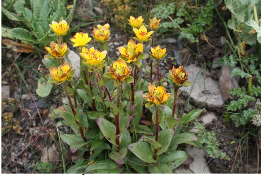
ཟངས་ཉིག (Saxifraga moorcroftiana)